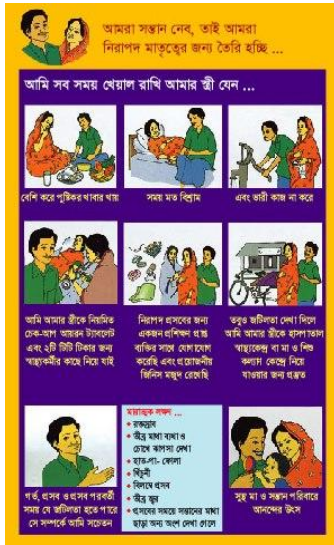
Selected content pages from Bangladesh MCH handbook '08: Birth Planning