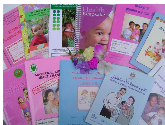
Cover pages of selected MCH handbooks in the world

The purpose of MCH handbook is to incorporate information that ranges from primary health care to specific issues of reproductive health, pregnancy and child care; acts as a motivational tool for health care providers and pregnant mothers' family to assist and encourage to empowerment of pregnant mothers to seek medical care, where and how, when needed; provides with home base medical records, referral documents of pre and post natal mother and child health care services to assures the continuum of care.