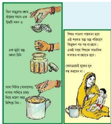
Oral dehydration solution (ORS) preparation instruction for diarrhoea treatment at home