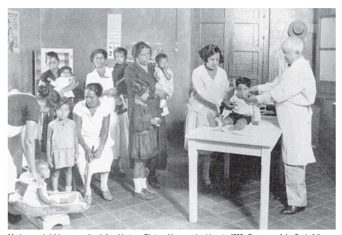
Mothers and children attending Infant Hygiene Clinic at Veracruz health unit, 1929.