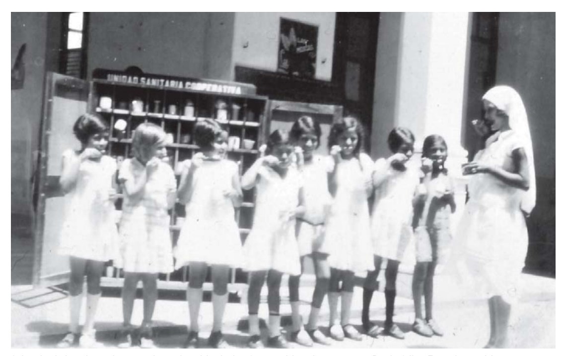
Schoolgirls brushing their teeth, with cubby holes for toothbrush storage at Rockefeller Foundation-Mexican Health Department cooperative health unit in rural Mexico.

The late 19<sup>th</sup> and early 20<sup>th</sup> century served as a watershed for children's health policy in Latin America. In the process of forging modern identities and societies amidst the challenges of immiseration, immigration, urbanization, and social disorder, state